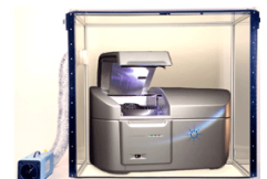
NoZone® TL Workspace with scanner inside