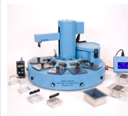
Little Dipper Processor